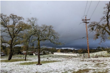
Shown: Oak Trees in Snow Near Lines

Shrubs under utility lines can act as ember catchers and prevent the invasion of flammable grasses.