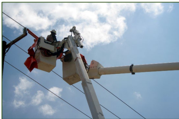
Shown: Utility Workers Using Bucket Trucks

The WSAB recommends assessment of vegetation beyond the immediate area beneath and closely around power lines.