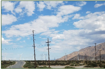
Shown: Shrubs Under Utility Lines, Palm Springs

Shrubs under utility lines can act as ember catchers and prevent the invasion of flammable grasses.